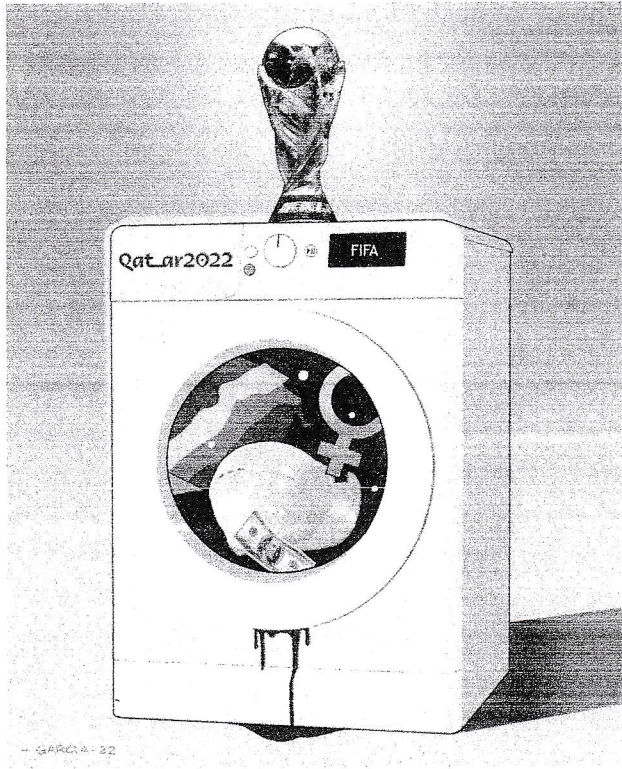
Caption: Qatar and FIFA try their best to present a squeaky-clean World Cup to the world.